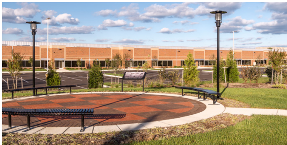
Erco Memorial Park

For more information on Rivertech Court at the Discovery District, visit: sjpi.com/rivertechcourt