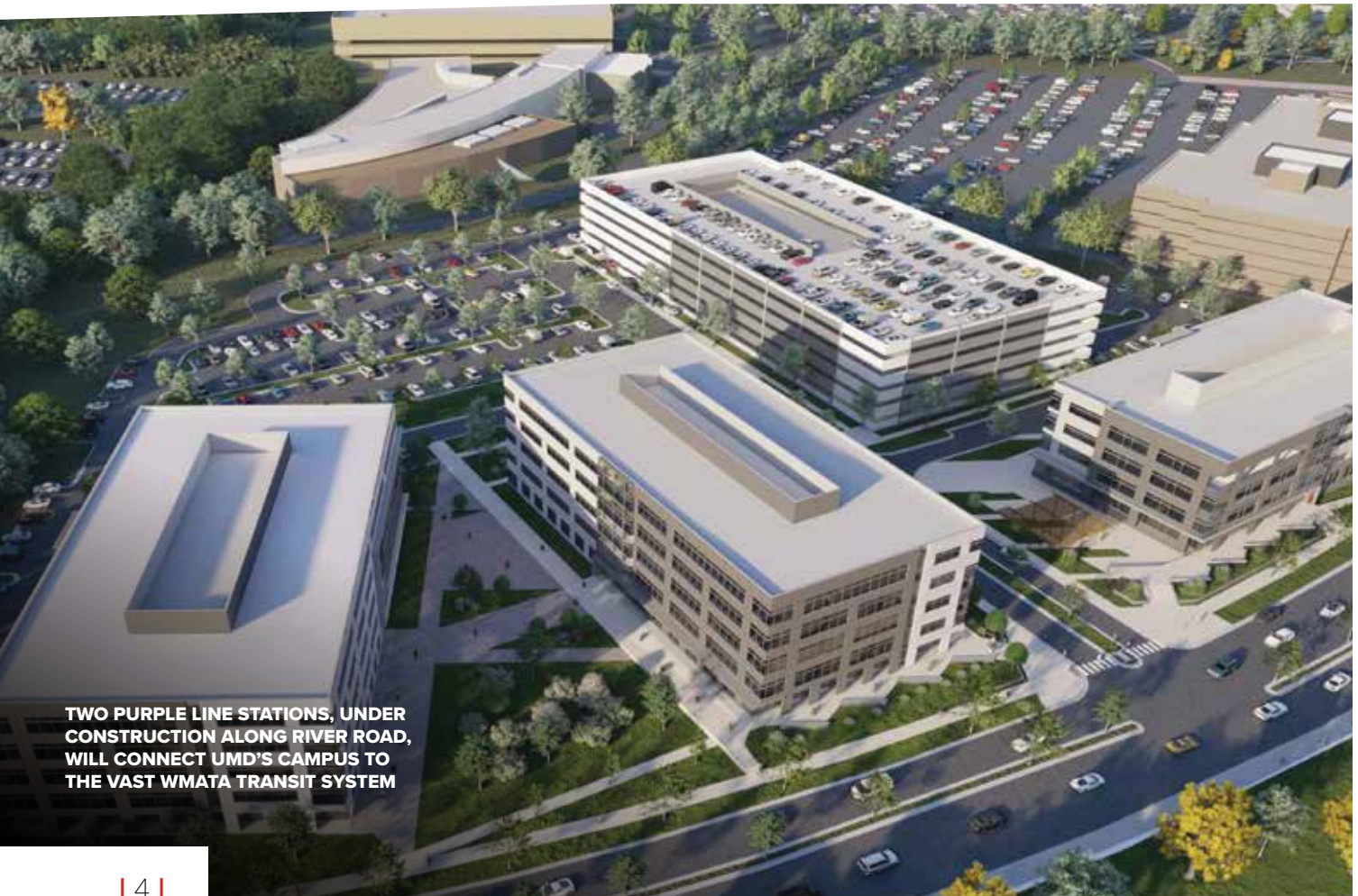
TWO PURPLE LINE STATIONS, UNDER CONSTRUCTION ALONG RIVER ROAD, WILL CONNECT UMD'S CAMPUS TO THE VAST WMATA TRANSIT SYSTEM

Walk to WMATA Green Line Metro, MARC, and two future MTA Purple Line Light Rail stations. Shuttle buses and the bike share program are a quick mode of transportation for getting around town.